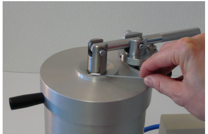
Introducing the powder in the Nebula for a proper dry dispersion